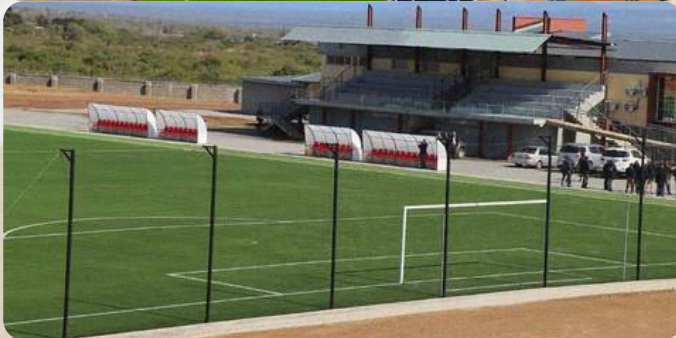
KaLanga Technical Centre (Lubombo)