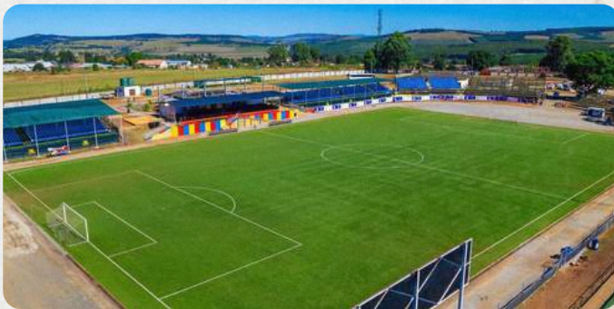
The Nhlanguano Technical Centre also known as King Sobhuza II Memorial Stadium (Shiselweni)

A major milestone in the EFA's growth has been infrastructure development. The Lobamba Technical Centre stands as a cornerstone of national team preparation, offering training grounds and accommodation for both junior and senior squads. Beyond this, the EFA embarked on an ambitious nationwide project to empower regional football through infrastructure development: