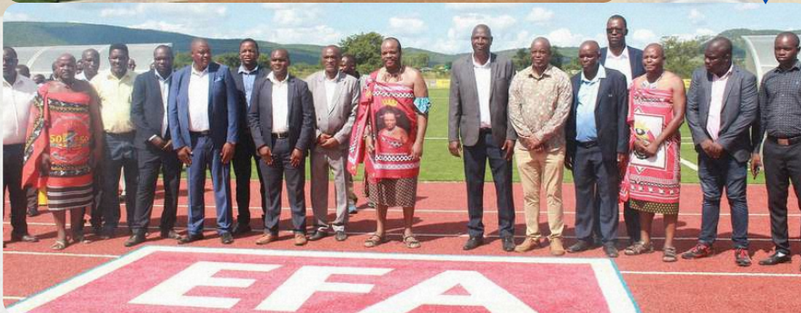
Mkhuzweni Technical Centre (Hhohho)

Inspired by the King's vision, the EFA is working towards installing